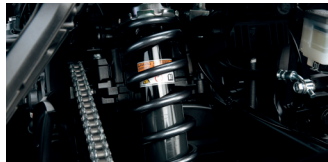
Adjustable KYB Suspension