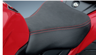
Single Seat 45100-13K50-000