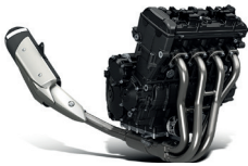
GSX-R Derived Engine