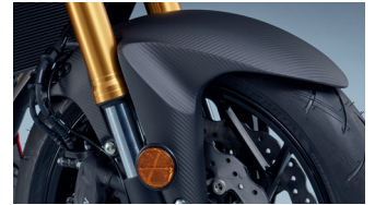
Carbon Fender 990D0-13K90-CRB