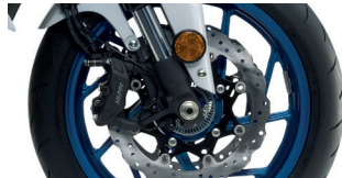
Powerful Radial Brakes