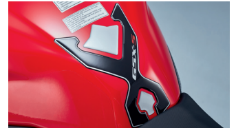
Tank Pad 990D0-13K01-BLK

£95 per Month (Plus Deposit and Optional Final Repayment)