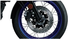
Wire Spoke Wheels