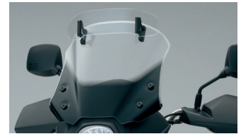
Vario Touring Screen 990D0-28K50-CLE

£95 per Month (Plus Deposit and Optional Final Repayment)