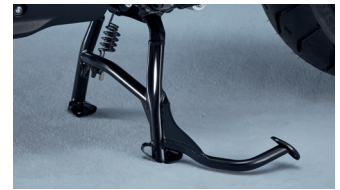
Centre Stand 42100-06870-000