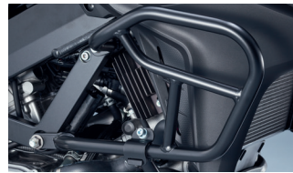
Accessory Bar 990D0-28K00-030