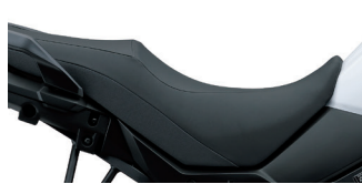
Long Haul Comfort