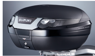
GIVI Top Case 990D0-E5500-000