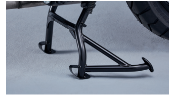
Centre Stand 42100-31820-000