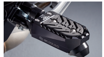
Wider Footrest Set 990D0-28K10-000

£119 per Month (Plus Deposit and Optional Final Repayment)