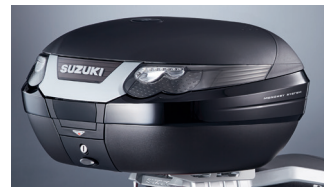
GIVI Top Case 990D0-E5500-000