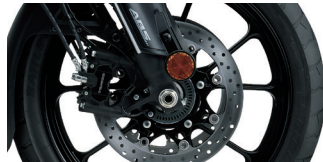
Motion Track Brakes