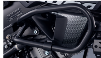
Accessory Bar 990D0-31J00-030