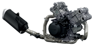
Characterful V-Twin Engine